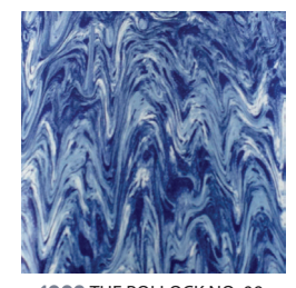
1009 THE POLLOCK NO. 09